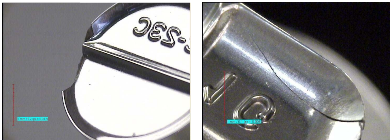
Figure 2: Example of punch tip edges showing cracking and removal from the punch

The punch tip, or 'cup', forms the profile of the tablet, which can contain detail such as embossing or break-lines. These effectively reduce the strength of the punch tips.