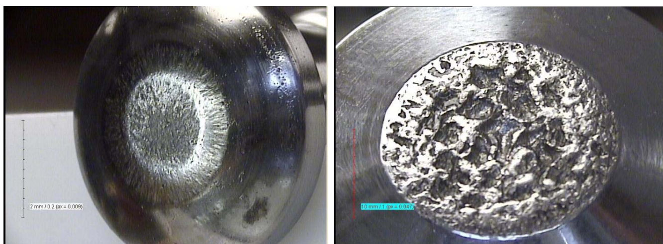
Figure 5 Wear to punch heads

The punch heads are subjected to high cyclic loadings, typically 20 kN to 50 kN, many thousands of times per hour of running. If the punches are running tight for any reason there will be resistance between the punch heads and the cams and rollers, adding in high frictional force. This will lead to premature wearing of the heads and eventual fatigue and total breakdown of the metal.