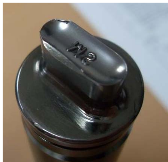
Figure 1: Example of damage to punch tip land area caused by poor handling

One of the most common issues experienced is handling damage. There are several stages of the tablet manufacturing process where damage can take place, including unpacking the tooling, loading/unloading the tools in or out of the tablet press, during tool cleaning/maintenance procedures and storage/transportation. If damage occurs it can lead to the production of poor quality tablets, and even further damage to both the tooling and the tablet press. It is important to understand the delicate nature of the tooling and operate good tool care, maintenance, storage and handling procedures, to keep this problem to a minimum.