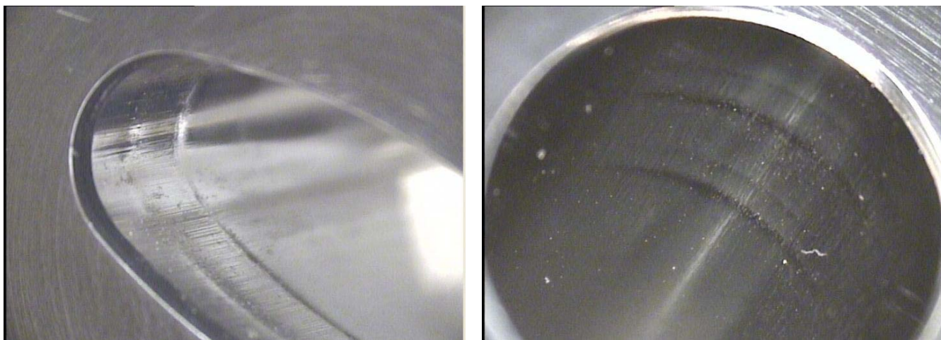
Figure 4: Examples of die bore wear, otherwise known as 'Ringing'